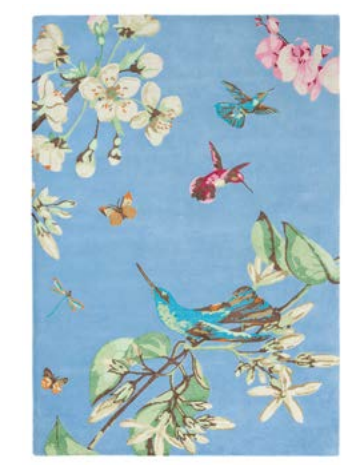
Hummingbird blue 37808

Made in England and hand painted by the skilled Wedgwood artisans, this collection combines exquisite hummingbirds with colourful botanical landscapes in bold shades, embracing nature's inspiration and bringing its beauty into the home. Hummingbirds symbolize joy and playfulness and are charming, miniature wonders of nature with a magical quality captured in this beautifully crafted prestige collection. The meticulous hand painted, raised enamel details celebrate Wedgwood's rich heritage and expertise while the enchanting colours and design make this tableware truly luxurious, to be enjoyed and cherished.