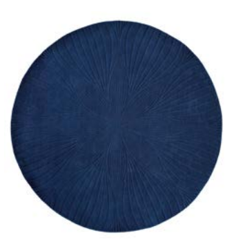
Folia navy round 38308