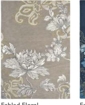
Fabled Floral grey 37504