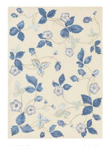
Wild Strawberry cream 38108