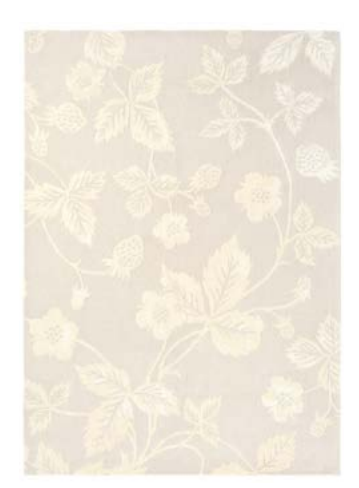
Wild Strawberry tonal 38201

The iconic Wild Strawberry collection forms part of the very heart of Wedgwood and its popularity has made this range a much-loved best seller throughout the world for over 50 years. The charm of the finely-drawn leaves, flowers and succulent red strawberries remains unchanged in the new pieces which are made in England using the traditional craftsmanship synonymous with Wedgwood.