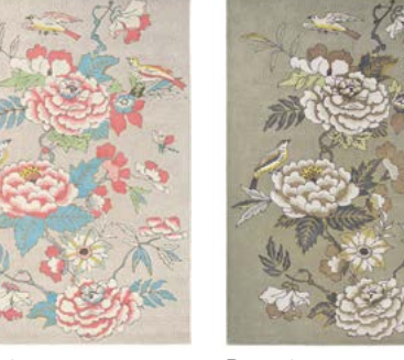
Paeonia taupe 37904