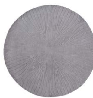
Folia grey round 38305