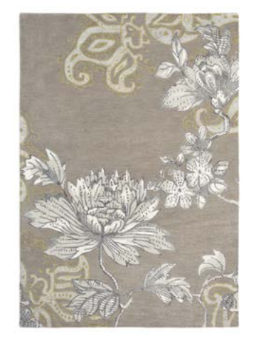
Fabled Floral grey 37504

Fabled Floral draws inspiration from the original pattern Fabled Crane and uses a feature peony motif to create a delicate floral repeat. The original was inspired by an exotic pheasant pattern from circa 1820 when the fashion for the Orient was at its height.