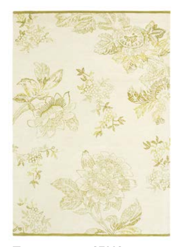
Tonquin cream 37009

Tonquin was originally produced on black Jasperware using an encaustic painting technique that required the utmost skill to achieve, the Tonquin design is typically bold and flamboyant, reflecting natural themes that were popular in the early 19th century.