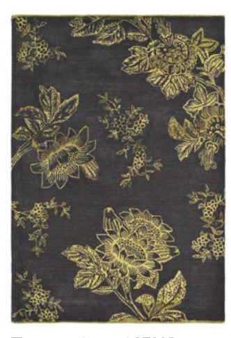
Tonquin charcoal 37005