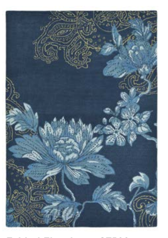
Fabled Floral navy 37508