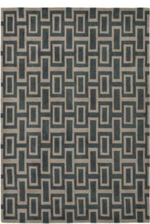
Intaglio black 37205