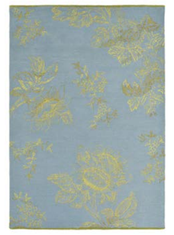
Tonquin blue 37008