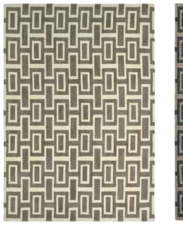
Intaglio grey 37201

Contemporary meets classical with the Intaglio pattern, which combines several embossed textures, popular during the Georgian era, into a modern and stylish design. The tactile ceramic pattern takes inspiration from the artisan knurling and engine turning techniques pioneered by Josiah Wedgwood in the 18th century.