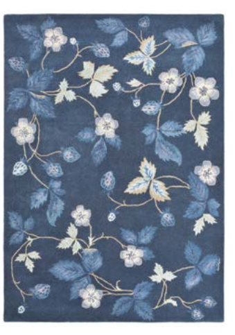
Wild Strawberry navy 38118